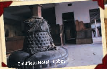
Goldfield Hotel- Lobby