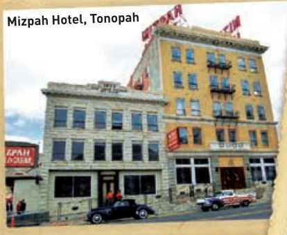
Mizpah Hotel, Tonopah