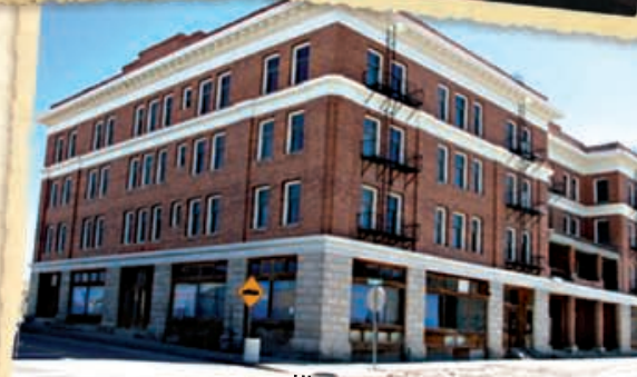
Historic Haunted Hotel, Goldfield