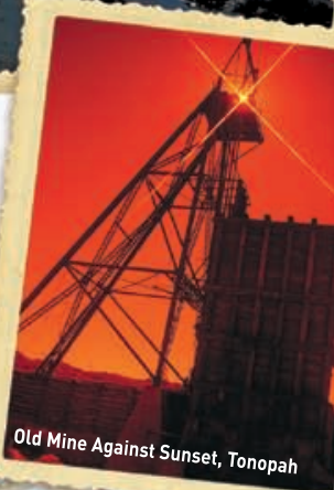
Old Mine Against Sunset, Tonopah