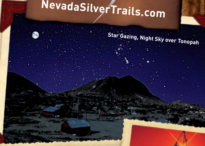
Star Gazing, Night Sky over Tonopah

NEVADA SILVER TRAILS NevadaSilverTrails.com