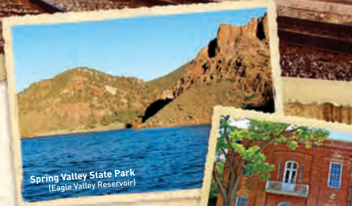
Spring Valley State Park (Eagle Valley Reservoir)