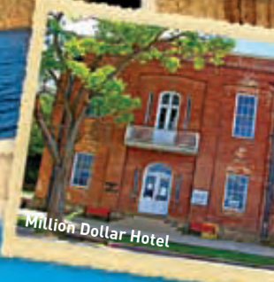
Million Dollar Hotel